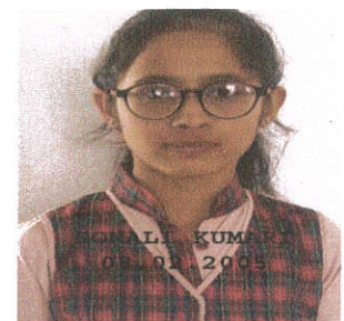
1 st Topper (89.4%-PCB)