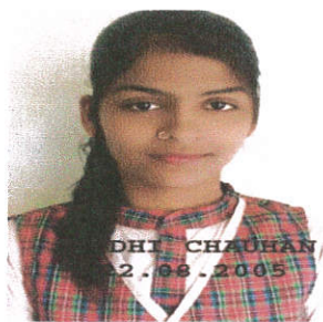
1 st Topper (95.4%-PCM)